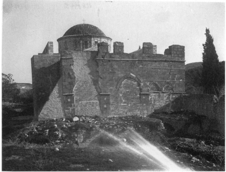
Figure 9. Attica, Monastery of Daphne on the Sacred Way.