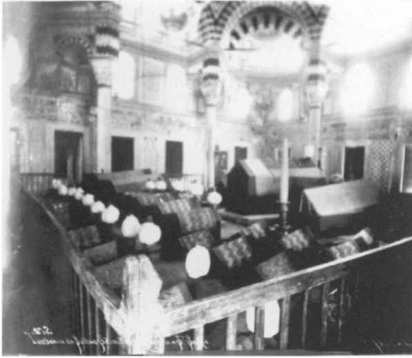
Figure 5. Istanbul, interior of the Mosque of Ayia Sophia; tomb of Selim II and family. Labeled “272. Tombeaux du Sultan Selim II et Famille à S. Sofie.” Photograph from a Sébah and Joaillier original. Photo courtesy the Institute of Archaeology, Oxford University

The negatives are contained in their own wooden box, ordered by site, and separated by index markers containing the names of the sites. The order of the sites is neither strictly geographical nor alphabetical, but appears haphazard: Constantinople, Olympia, Patras, Corinth, Tiryns, Epidauros, Argos, Corfu, Ephesos, Smyrna, Nauplia, Mycenae, Athens Museum, Eleusis, Athens, and Rome. The index papers were created from pages torn from an accounting ledger in Stebbing’s copperplate handwriting. When dates appear on these papers, they range from November 1897 to January 1898. Thus, Stebbing created these index papers sometime after his journey, when he organized the negatives.