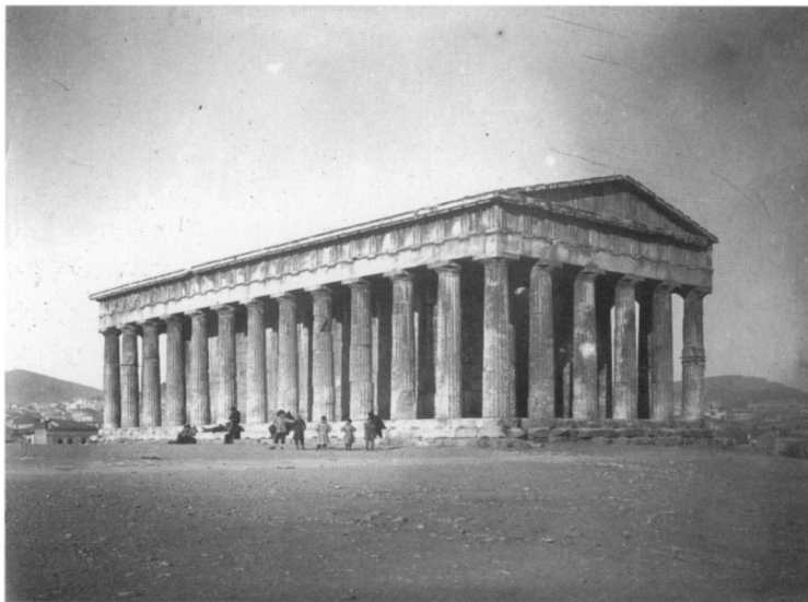
Figure 13. Athens, Theseion. T. R. R. Stebbing negative. Photo courtesy the Institute of Archaeology, Oxford University

the north, depict the Theseion: one by James Robertson (ca. 1853–1854) and another by Dimitrios Constantin (ca. 1860). 97 These two examples are similar to Stebbing's close-up (Fig. 13), although they are not from quite the same angle.