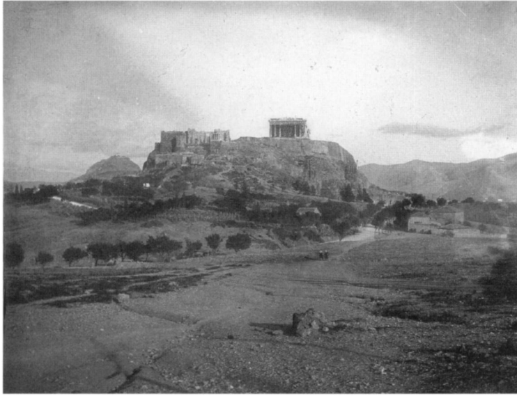
Figure 10. Athens, distant view of the Acropolis from the west. T. R. R. Stebbing negative. Photo courtesy the Institute of Archaeology, Oxford University

the new Academy building, the only modern public building Stebbing photographed in the city, was constructed in a neoclassical style.