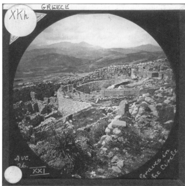
Figure 22. Lantern slide of Mycenae, Grave Circle A. Labeled “Graves in the Circle.” J. L. Myres negative 2068. Oxford slide XK 30 (recatalogued as XKh). Hellenic Association xxi.26 (Newton and Co. label in upper left corner of slide).