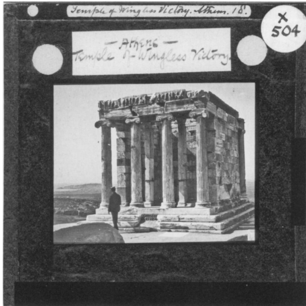
Figure 18. Lantern slide of Athens, Temple of Athena Nike on the Acropolis. Labeled “Temple of Wingless Victory.” Oxford slide X 504.