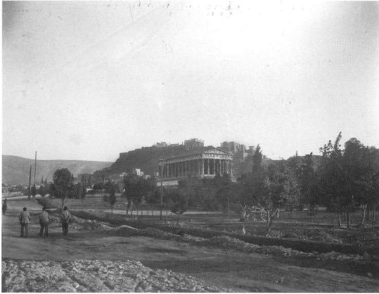
Figure 12. Athens, Theseion from a distance with the Acropolis in the background. T. R. R. Stebbing negative. Photo courtesy the Institute of Archaeology, Oxford University