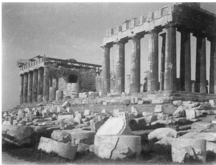
Figure 11. Athens, Parthenon. T. R. R. Stebbing negative. Photo courtesy the Institute of Archaeology, Oxford University

An 1870 publication by William Stillman, which may have been available to Stebbing, reproduces Stillman's photographs of the Athenian Acropolis, beginning with distant views of the Acropolis before concentrating on its individual monuments shown from different angles. 93 Pausanias's route around the city was plotted with reference to this central landmark: the Agora and the area to the west and north, the "City of Hadrian" or the area to the east, the area to the south, the Acropolis itself, and the area of the Pnyx immediately to the west. Murray's Handbook and Baedeker's Guide diverge from Pausanias's route around the city only at the starting point, the new parliament building.