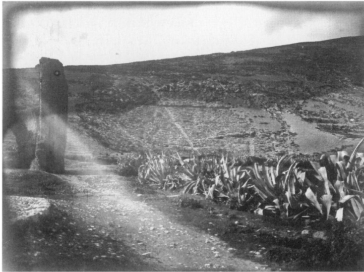
Figure 14. Argos, theater from a distance. T. R. R. Stebbing negative. Photo courtesy the Institute of Archaeology, Oxford University

enclosure, the Tomb of Atreus was photographed showing the dromos, entrance, and corbelled vault. One of Stebbing's out-of-focus compositions, taken of the interior from the entrance of the tomb and showing the corbelled vault, resembles an engraving that had appeared in the Illustrated London News in 1877. 102 The obligatory photographs of the Lion Gate—front and back—are accompanied by images of the excavated Grave Circle A (see Fig. 23, below) and the area located above. There are fewer images of Tiryns. These show the citadel from a distance, the megalithic blocks used in its construction, and the covered passage to the well.