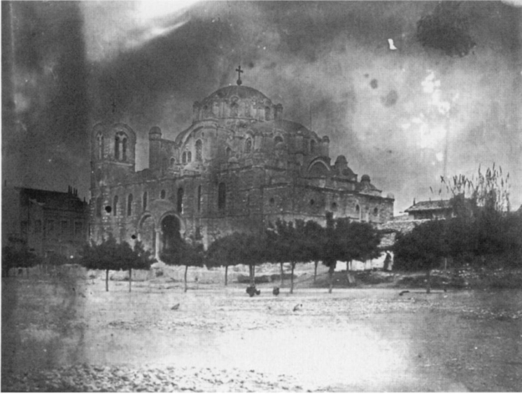
Figure 7. Patras, 19th-century church of Ayios Andreas.