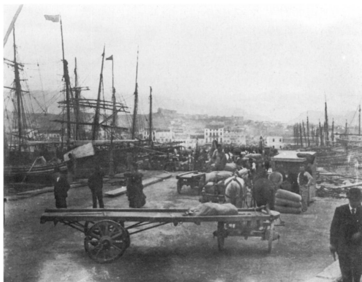
Figure 4. Patras harbor. T. R. R.