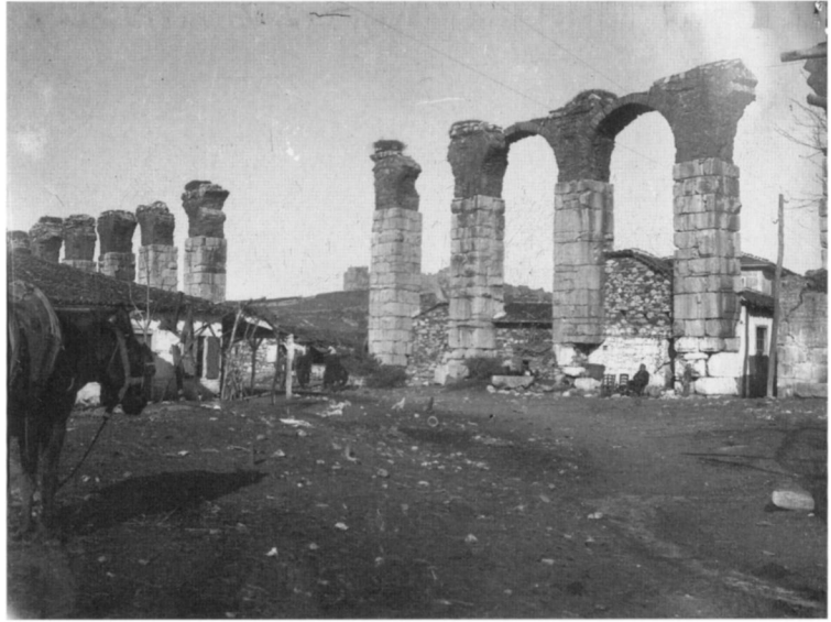
Figure 6. Ephesos, the pillars of the Basilica of Saint John constructed by the emperor Justinian.